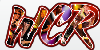
World Classic Rockers Afterparty Show