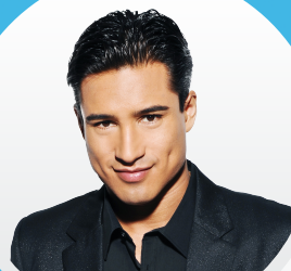
Hosted by Mario Lopez

Wear your Favorite Team Color (wedged or block heels, no stilettos)